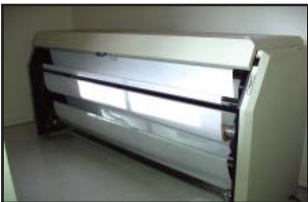
MICRODYNAMICS T-60 72" Plotter