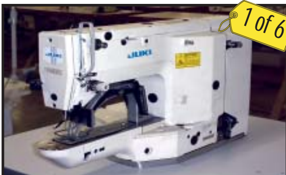
JUKI LK-1852 Bar Tacker