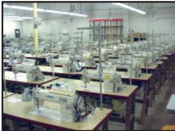
(347) Sewing Machines