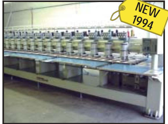
BARUDAN Mdl. BE-MSH-YS-15T Programmable Automatic Embroidery Machine