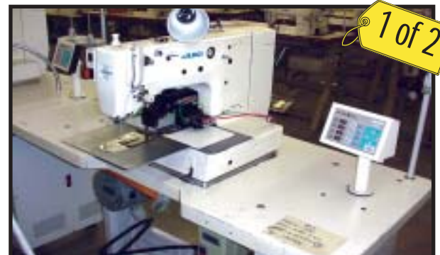
JUKI AMS-210C Programmable Label Sewer