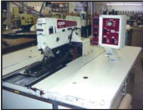
REECE 32-100 Automatic Back Pocket Setter