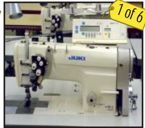
JUKI LH-3168-7 Double Needle Lockstitch, Split Bar