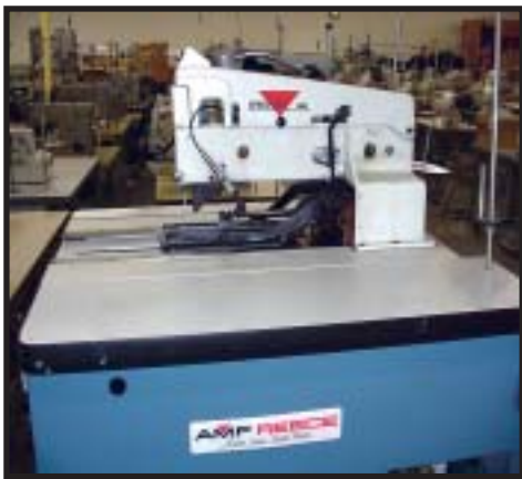
AMF-REECE Speedwelt-1000 Automatic Back Pocket Welt