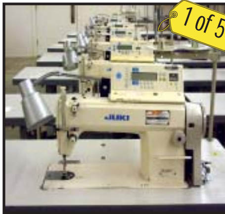
JUKI DDL-5550N-7 Double Needle Lockstitch, Drop Feed