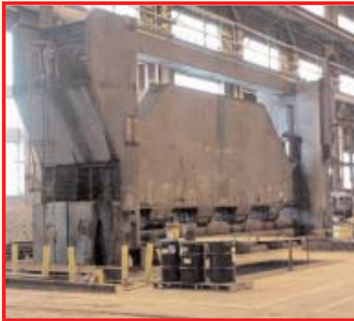
HUGH SMITH 1500-TON ROLL PRESS

(5) CLYDE 35 TO 50-TON CAP REVOLVING CRANES, 20 TO 26 GAUGE, 80' TO 110' BOOM