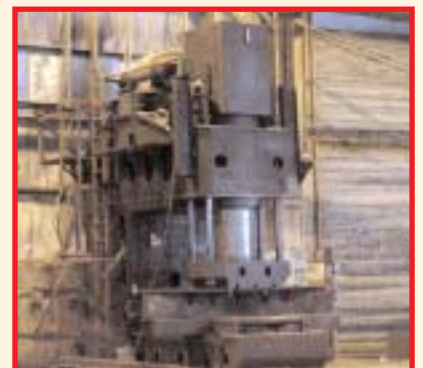
> FARQUHAR MDL. 2251 200-TON HYDRAULIC VERTICAL PRESS, S/N 34153PG