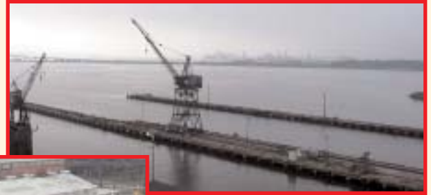
REPAIR BERTHS WITH CRANE