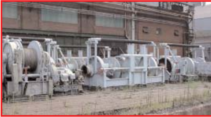
(6) JOHNSON SKID-MOUNT MINE SWEEP WINCHES

A 10% BUYER'S PREMIUM APPLIES TO ALL ON-SITE PURCHASES