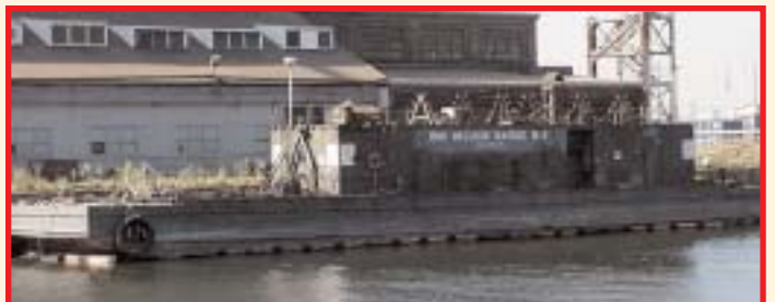
VACUUM SLUDGE BARGE, 28' X 125'