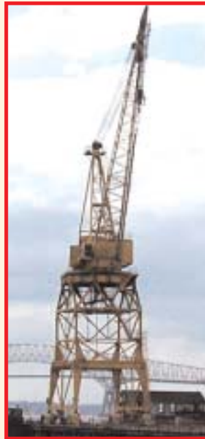
CLYDE 200-TON REVOLVING CRANE