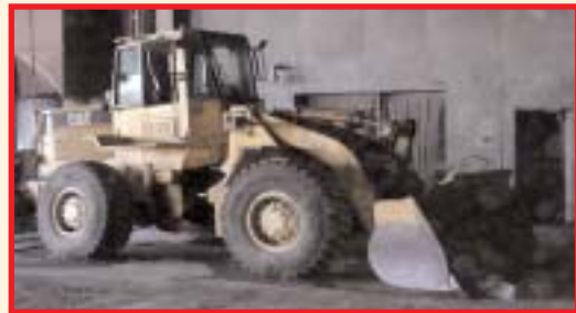
< CATERPILLAR MDL. 936E ENCL. CAB FRONT END LOADER