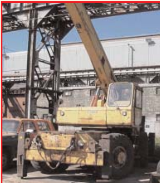
GROVE MDL. RT60/60S ROUGH TERRAIN, 3-STAGE, 18-TON CRANE