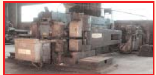
HUGH SMITH 700-TON MARK 5 HYDRAULIC SHIP'S FRAME BENDER