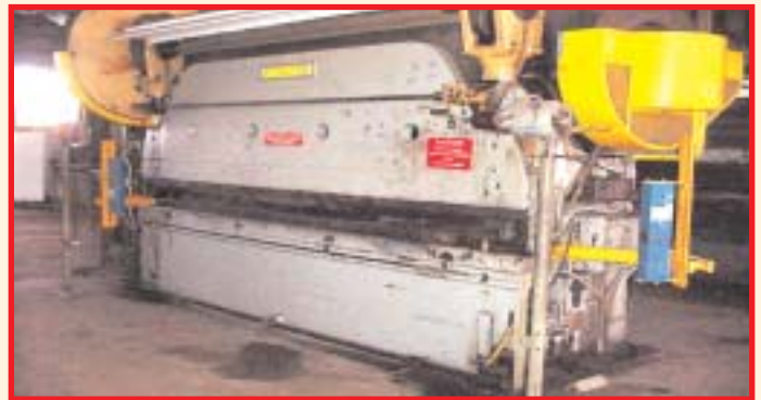
CINCINNATI 90-TON POWER FORMING 10' PRESS BRAKE