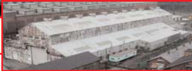
SHEET METAL SHOP