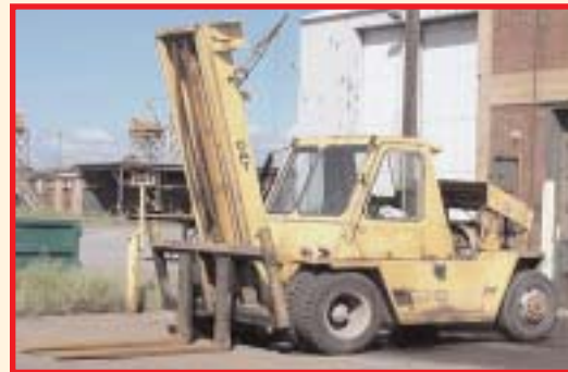
< CATERPILLAR 20,000 LB. FORKLIFT

SEABIRD FIBERGLASS 22' BOAT WITH 200 HP – V6 – OUTBOARD YAMAHA MOTOR, WITH ESCORT GALVANIZED TANDEM AXLE TRAILER