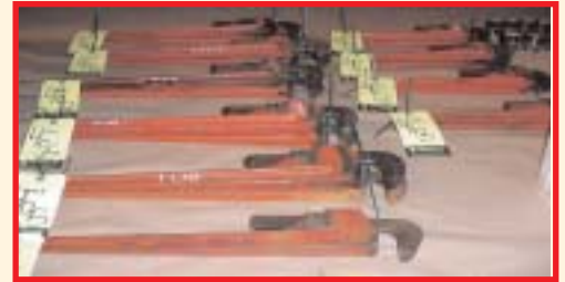
> PIPE WRENCHES

HUGE QUANTITIES OF TOOLS INCLUDING PIPE WRENCHES, SOCKETS, RATCHETS, (1000) RECIPROCATING SAW BLADES, PNEUMATIC CHISELS, PNEUMATIC ANGLE GRINDERS, DRILL PRESSES, DRILLS, SAWZALLS, JIG SAWS, CIRCULAR SAWS, PALM SANDERS, MICROMETERS, CALIPERS, TEST EQUIPMENT, HOISTS, CONVEYORS, MOTORS, SPARE PARTS, LAMPS, FANS, HEATERS, PUMPS, PALLETJACKS, LADDERS, DOLLIES, WORK GLOVES, WELDING GLOVES, AIR HOSE & OFFICE EQUIPMENT OF DESKS, CHAIRS, FILE CABINETS, WORKTABLES, COMPUTERS, PRINTERS & MUCH MORE!