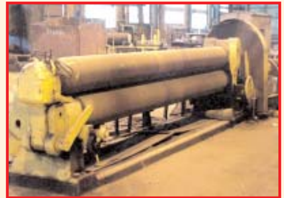
BEMENT MILES MDL. 604A MAST ROLL PRESS