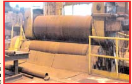
> BERTCH MDL. 9244 15' ROLL PRESS