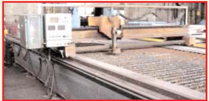
LINDE MDL. UCNC-7 PLASMA SEMI-AUTO PLATE CUTTER