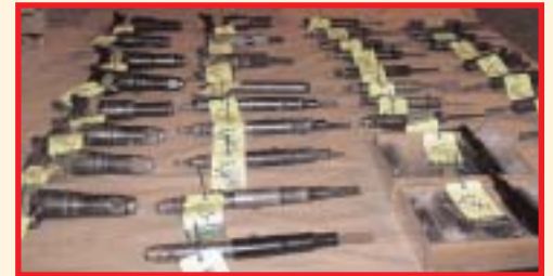
> PNEUMATIC CHISELS